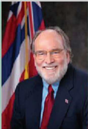
Friend of Social Work Governor Neil Abercrombie State of Hawaii