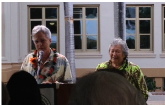
The grand opening and dedication of the new home for the MBT School of Social Work, Gartley Hall, UH Mānoa