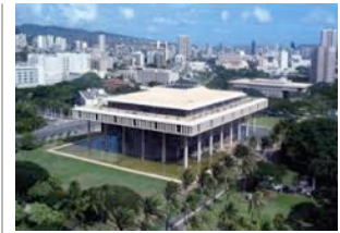
SOCIAL WORK LICENSING BILL REVISION