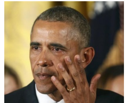
President Obama broke into tears while announcing new executive orders on gun control.