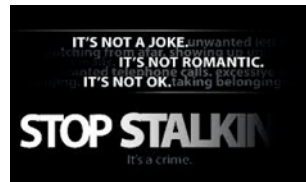
THE STATS ON STALKING: STALKING AWARENESS QUIZ