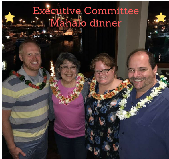
★ Executive Committee Mahalo dinner ★