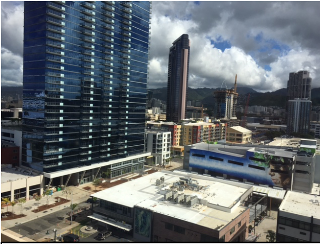
A view of the rapidly developing Kaakako area from the NASW office window

A growing number of neighborhoods, mostly in major metropolitan areas, are currently experiencing gentrification. First coined by sociologist Ruth Glass in the 1960s, “gentrification” refers to a form of neighborhood change that occurs when higher-income groups move into previously low-income areas, potentially altering the cultural and financial landscape of the neighborhood. In many American metropolitan areas, rising demand for housing in gentrifying neighborhoods has exacerbated the affordability crisis, increasing the potential for displacing long-term, low-income residents and creating greater barriers to entry for new low-income residents looking to move to places of opportunity. On May 25, 2016, the Federal Reserve Bank of Philadelphia, in partnership with HUD’s Office of Policy Development and Research, New York University’s Furman