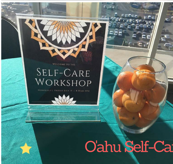
★ Oahu Self-Care Workshop ★