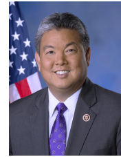
REMEMBERING MARK TAKAI