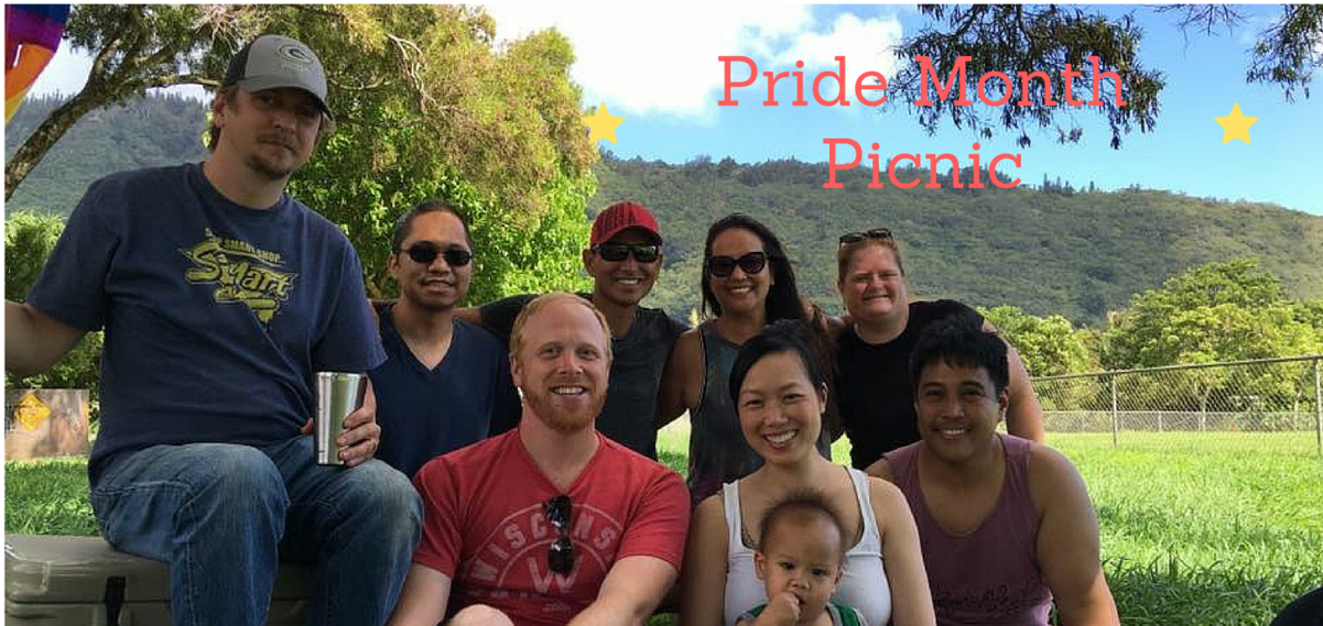
★ Pride Month Picnic ★