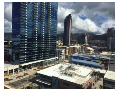
GENTRIFICATION & NEIGHBORHOOD CHANGE